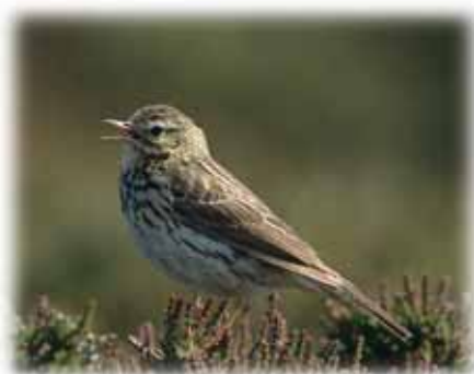
Corheddyd y waun Meadow pipit

3. Follow road round to right for about 150m and, just after crossing a stream, turn right onto a track (horse rider sign). Go through a gate and follow the path behind a partly built house. Continue on path that contours around