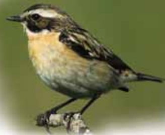
crec yr eithin / whinchat

4. Turn right up the road and follow it uphill to a gate where the tarmac road ends. Go through the gate and continue ahead on a clear track. Follow this track for approximately 1km alongside a tree-topped stonewall, going through another gate/stile and gradually climbing. Continue on the track across more open land until you reach the gate and stile beside Moel Arthur car park. Cross over the stile to return to your starting point.